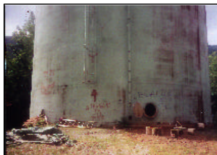
Double Gate 500,000 Gallon Ground Storage Water Tank Seriously in Need of Rehabilitation!