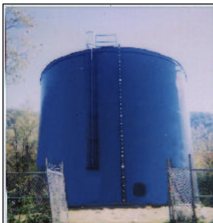
Double Gate 500,000 Gallon Ground Storage Water Tank Coated and Lined with Madison's 100% Solids Polyurethane.