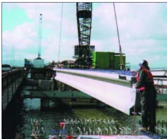
Concrete girder with aliphatic polyurea topcoat being placed on substructure for San Mateo-Hayward Bridge widening project

As part of a $113 million widening project by the California Department of Transportation (CalTrans), the bridge is receiving a protective coating on new concrete structures that officials expect will prolong the bridge's life by 25 percent. The approach is intended to prevent