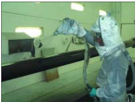
Spray application of polyurea to steel pole

A key reason polyaspartic ester-based aliphatic polyurea coatings were selected for this project is be-