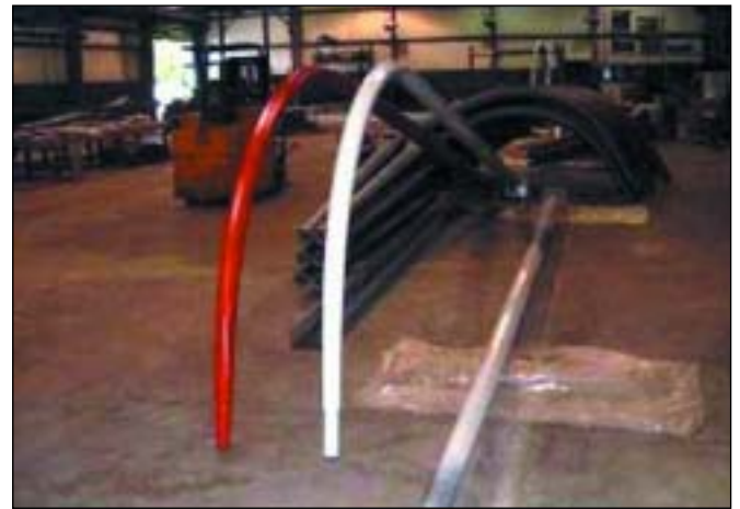
Light pole supports protected with polyurea

The results indicate that the two-coat, fast-cure coating